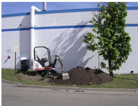
Excavation Site St. Paul, MN Climate Zone 1

Heat Flow Apparatus" immediately after excavation. Moisture content was determined by measuring the sample weight at the time of removal and again after being oven dried.